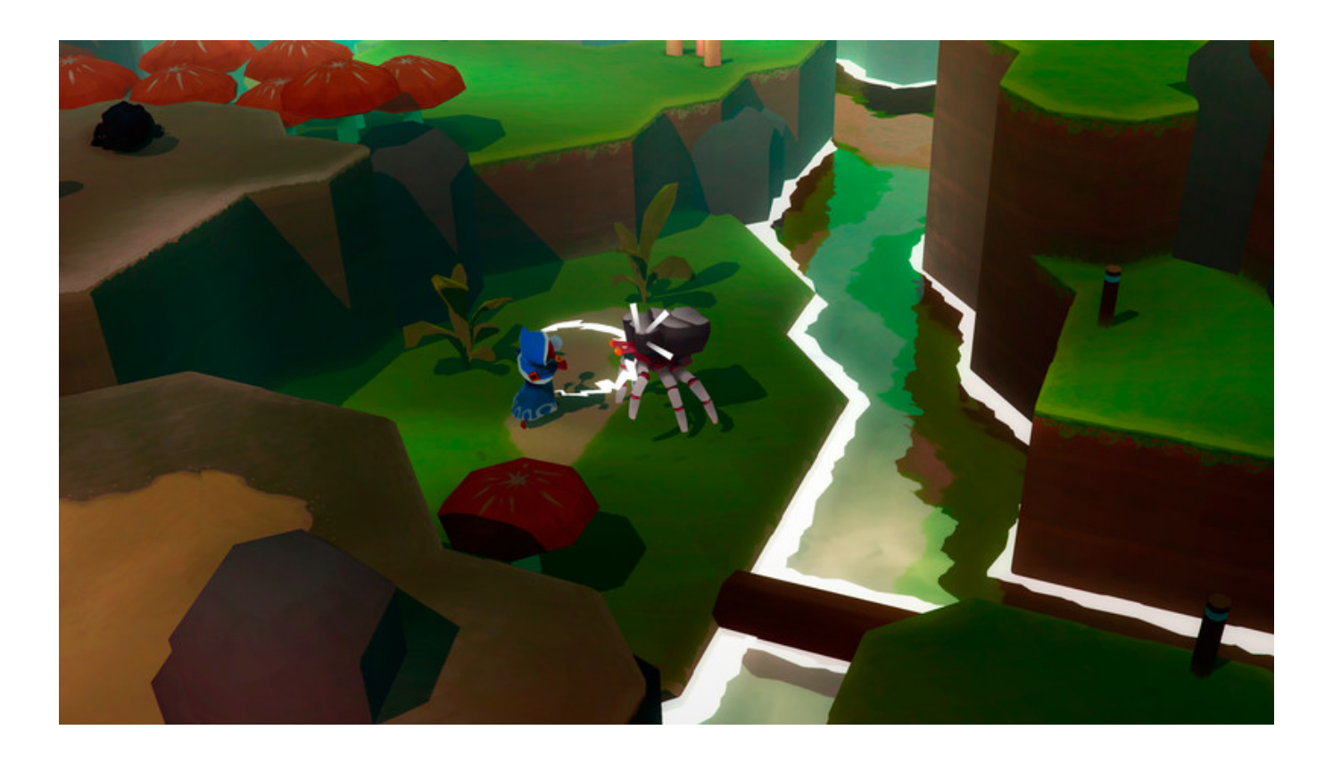
World To The West Download For Pc Highly Compressed